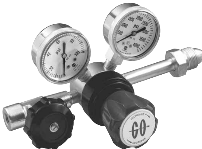
(Shown with optional outlet valve)

Single Stage Brass Cylinder; Gas Pressure Reducing Regulator